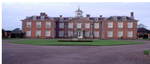
Hanbury Hall from the front entrance

tel: 01527 821214 or email: hanburyhall@nationaltrust.org.uk